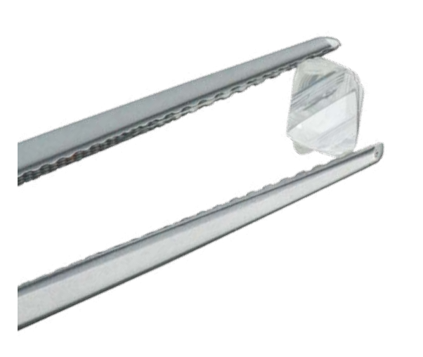
Rough diamond