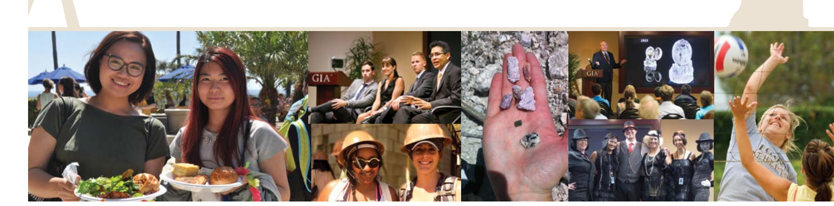
Carlsbad: Barbecues in the sun; panels with industry experts at GIA Jewelry Career Fair; tours of a working mine; a volleyball tournament – GIA in Carlsbad is fulfilling on every level.

GIA in New York hosts activities throughout the year that help you forge friendships with your classmates. The Halloween festivities, tours of the Diamond Dealers Club and manufacturing houses are some of the highlights. You'll be just a few blocks from prestigious auction houses, Times Square, and the theater district. And you'll be a subway ride away from renowned museums, and hundreds of world-class restaurants, chic bars and cafés. So there's never a dull moment in the city that never sleeps.