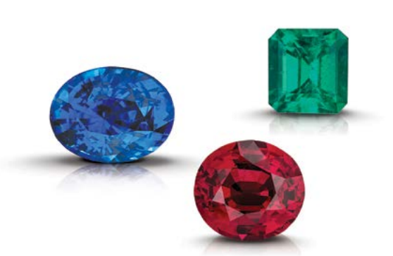
Ruby Sapphire