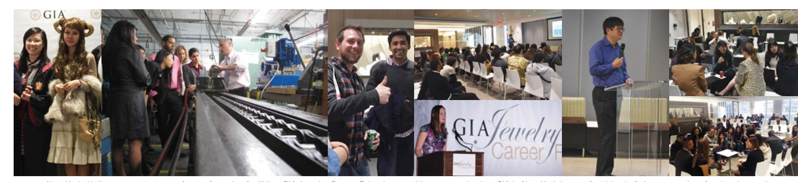
New York: Halloween party; tours of manufacturing facilities; GIA Jewelry Career Fair where exciting careers begin – GIA in New York is a perfect blend of pleasure and professional pursuits