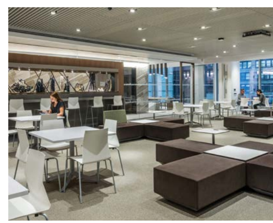
Student Lounge area at GIA in New York

GIA in New York is in the middle of the Diamond District, where 90% of the diamonds entering the U.S. make their first stop. The campus is located in the prestigious International Gem Tower in Manhattan, and occupies almost 100,000 square feet, with an entire floor dedicated to education. Stocked with the latest technology and individual workstations, classrooms are designed to help you get the most from your studies. Beyond its doors, a world of opportunity waits for you.